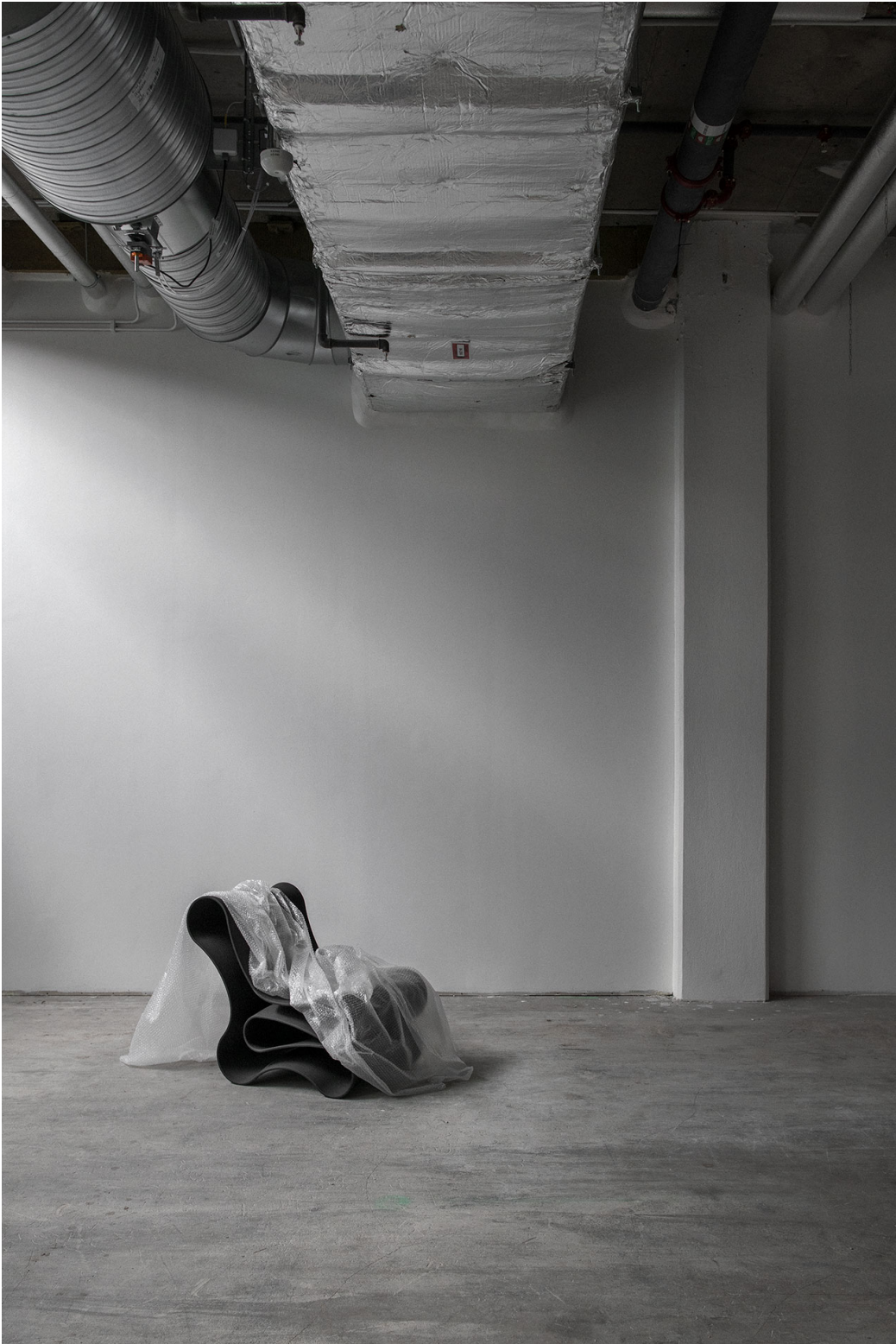
Reform Design Lab is participating in the new design week with a curated city centre exhibition.

Stockholm Creative Edition grew from an initial idea to action after more than a year without cultural contexts and meeting places, as a result of the global pandemic. Seen as a complement to the existing fair, it is loosely modelled on the successful event 3 days of Design in Copenhagen, but welcomes collaborations between all creative fields including craft and food. Among the many brands involved in the first version of Stockholm Creative Edition is Massproductions, Lammhults, Atelier Sandemar, Tarkett, Gemla, Reform Lab, Asplund and Fogia. The list of brands involved will be updated continuously online at stockholmcreativeedition.com